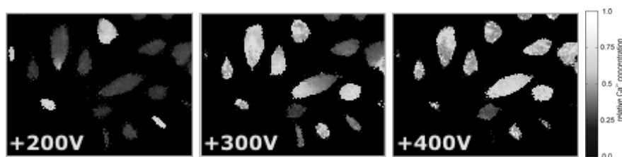
Figure 2: Cells stained with Fura-2AM and exposed to electric pulse with increasing amplitude.

Using a BetaTech device, deliver one electric pulse of 100 \mu\text{s} with voltages varying from 150 to 300 V. Immediately after the pulse, acquire two fluorescence images of cells at 540 nm, one after excitation with 340 nm and the other after excitation with 380 nm. Divide these two images in MetaFluor to obtain the ratio image ( R = F_{340}/F_{380} ). Wait for 5 minutes and apply pulse with a higher amplitude. After each pulse, determine which cells are being electroporated (Figure 2). Observe, which cells become electroporated at lower and which at higher pulse amplitudes.